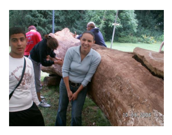
Youth Exchange in Germany