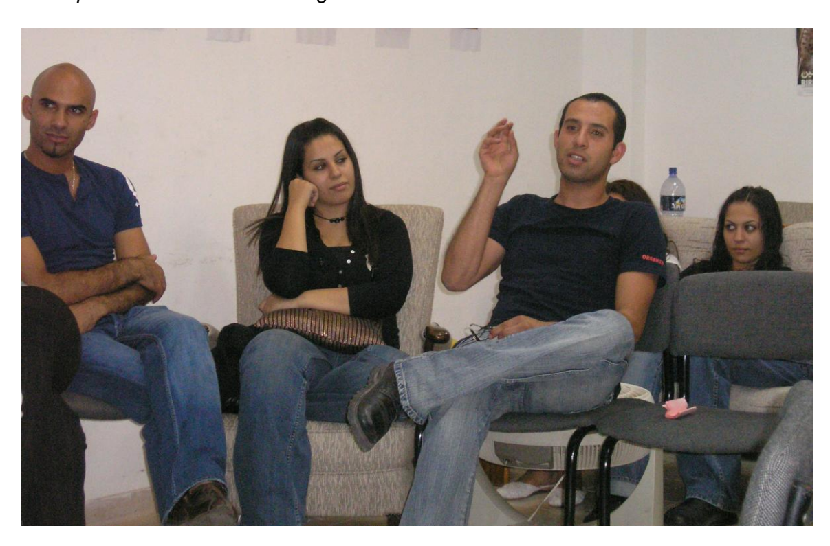
Training on Non-Violence