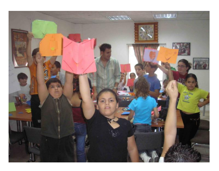
Beautiful children, creative minds – the Art of Non-Violence

"Justice is when there is balance. But right now there is no balance." - One of the youth commenting on the wall, and life in Bethlehem; how it feels to be a young person here.