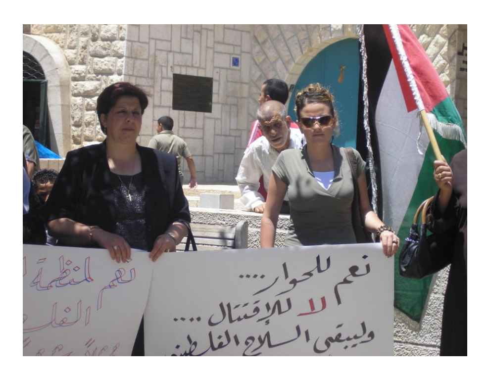
Direct Civil Action calling for Non-Violence