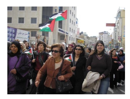
International Women's Day March