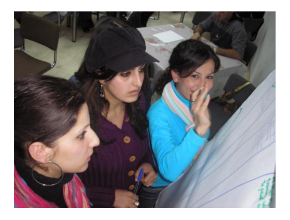
Preparation for Jericho Training

Through our Youth Program we provide the opportunity for weekly workshops and activities to young people in our community. Meeting on a consistent basis provides these youth with a peer community that they can trust and invest in. As we offer trainings on such topics as Human Rights, Democracy, Non-Violence, and Personal Development, the youth are not only actively engaging important current world issues, but they are also growing together and learning what it means to be committed to one another and to their community. We have lively discussions and creative activities on a weekly basis. But Wi'am also provides youth with connections to their peers throughout the world with opportunities for international and regional cultural youth exchanges. The youth have learned about and participated in Advocacy and Non-Violent Direct Action. Such experiences give them the chance to learn from their community and to educate their community. We are so proud of all the hard work they do, and we look forward to the continued growth of this youth program.