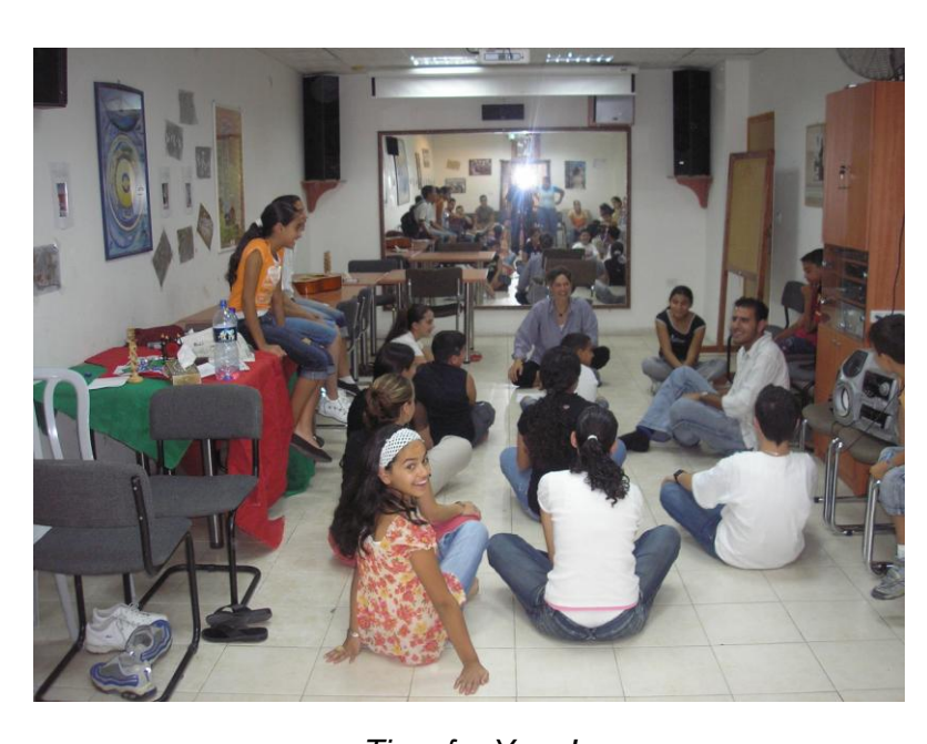
Time for Yoga!